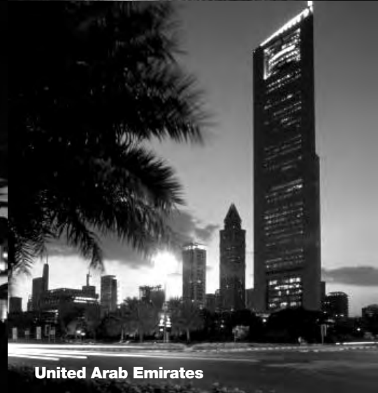
United Arab Emirates